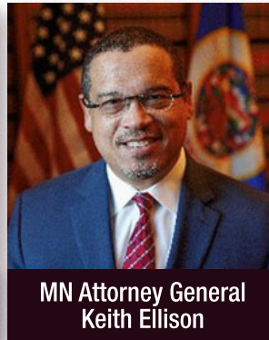
MN Attorney General Keith Ellison