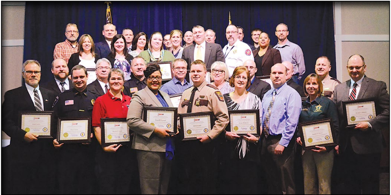
Emergency management certificate recipients recognized at the 2016 Governor's Homeland Security and Emergency Management Conference. A total of 179 people completed an emergency management certificate program in 2015 and 2016.