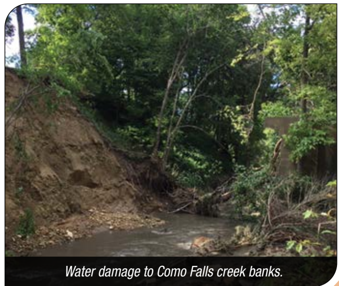
Water damage to Como Falls creek banks.