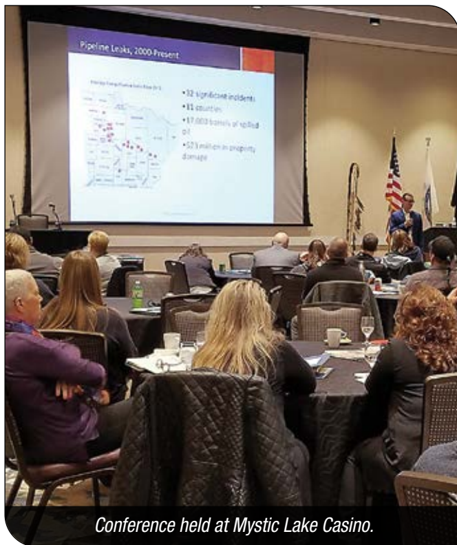
Conference held at Mystic Lake Casino.

That visual evidence was just the tip of the iceberg in terms of what local and federal agencies were doing to keep football fans and non-fans alike safe Super Bowl weekend. But what you didn't see was Minnesota's Department of Public Safety Homeland Security and Emergency Management (HSEM) division waiting quietly in the background, ready to lend support and resources should the need arise.