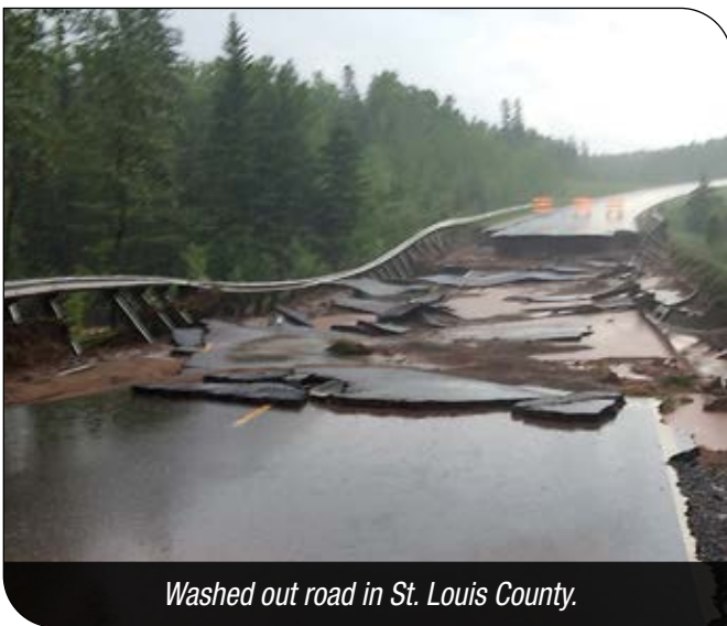
Washed out road in St. Louis County.

On the evening of August 27 through the morning of August 28, heavy rains fell, totaling nine inches. The persistent rain caused flash flooding in the city of Hokah to the point that Thompson Creek was rerouted and the creek no longer flowed over the falls. This caused significant damage to the historic Como Falls Park, which dates back to the 1800s. A state disaster was declared to assist the local officials in Houston County and the city of Hokah to begin the recovery process and try to restore Como Falls.