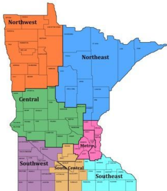
Figure 2: Minnesota Interoperable Communications Regions

More information about the SECB is available at: https://dps.mn.gov/entity/srb/Pages/default.aspx