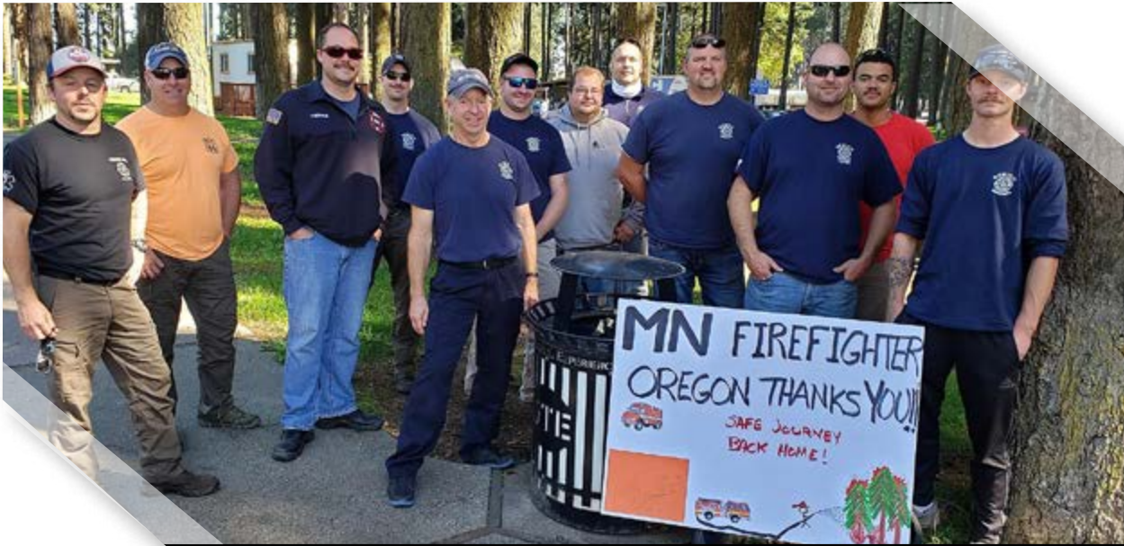
Minnesota firefighters sent to Oregon and assisted in controlling the Oregon wildfires last September.

While deployed, the EMAC members worked 12-hour days in rough, unfamiliar terrain. After work, they rested and slept in tents on the ground in makeshift camps. Community members expressed their appreciation for the firefighters with “Thank You” signs and cake upon the release from their mission.