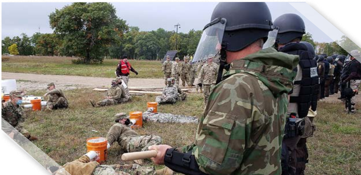
Law enforcement participating in the Line 3 public safety planning exercise conducted at Camp Ripley.

Additionally, the team facilitated training and exercise planning workshops to all regions of the state in 2020. This included exercise support and development for several regions, as well as for statewide impact events such as the Line 3 public safety agency planning and coordination process.