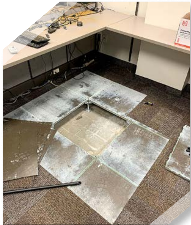
Major water damage in SEOC causes disruption to activation activities.

The new SEOC will not only give staff the room and resources they need to manage emergencies; it will also be the state's designated "continuity of government" facility. This means that during a catastrophic event, the SEOC will be the place where the governor and other key officials would relocate to ride out the emergency.