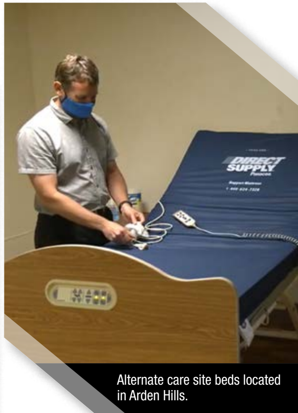
Alternate care site beds located in Arden Hills.