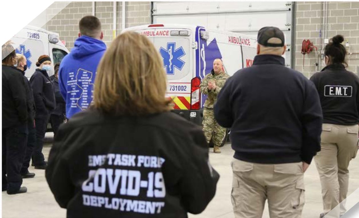
Federal disaster declaration for assistance during COVID-19 response.

Under a disaster declaration, reimbursable activities typically include activation of the State Emergency Operations Center, National Guard costs, law enforcement, mental health support, and other measures necessary to protect public health and safety.