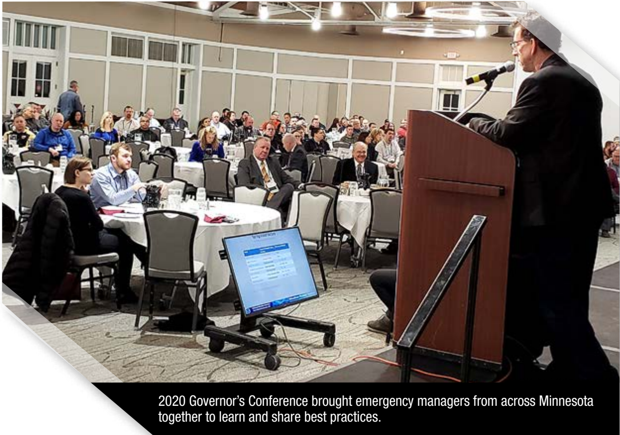
2020 Governor's Conference brought emergency managers from across Minnesota together to learn and share best practices.