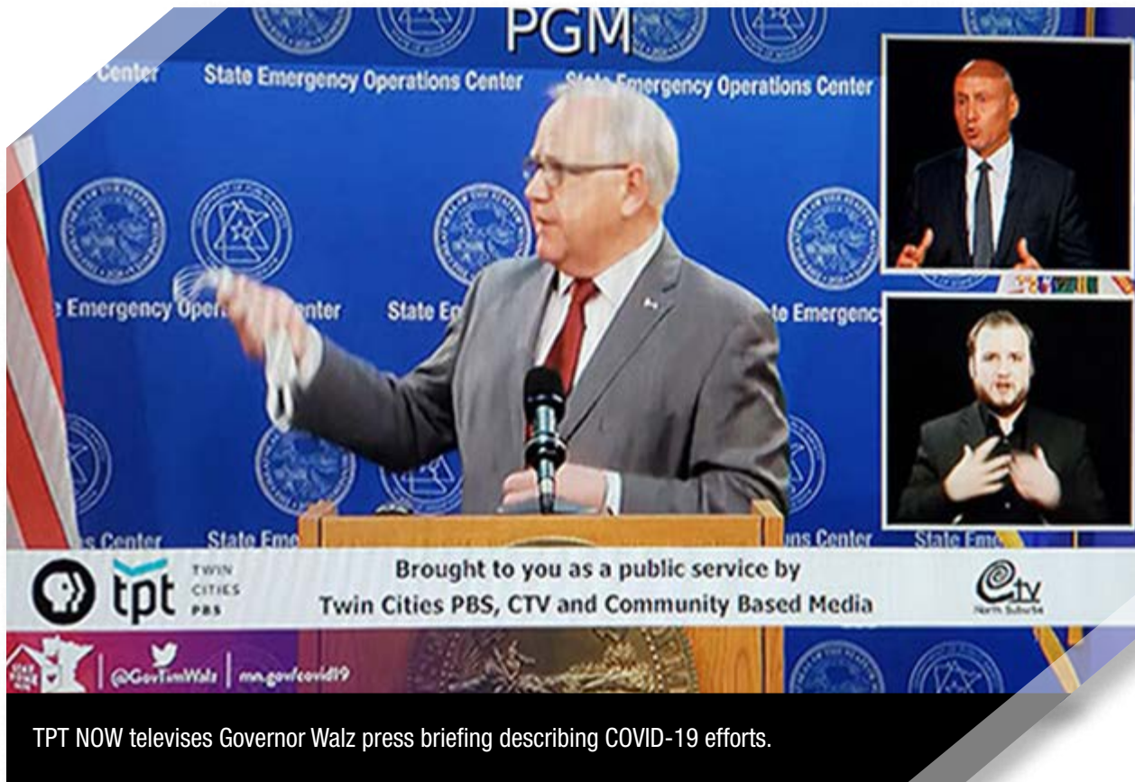
TPT NOW televises Governor Walz press briefing describing COVID-19 efforts.