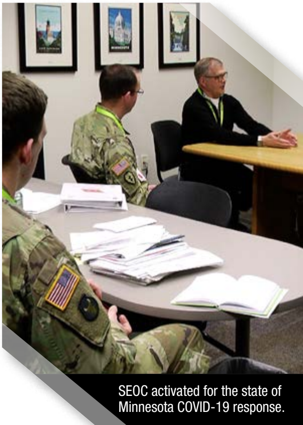
SEOC activated for the state of Minnesota COVID-19 response.

It may not have made headlines, but Minnesota experienced some flooding in April of 2020. During this time, the HSEM coordinated the activation of the Minnesota National Guard (MNNG) to assist with flooding control and other mitigation efforts in the Red River Valley.