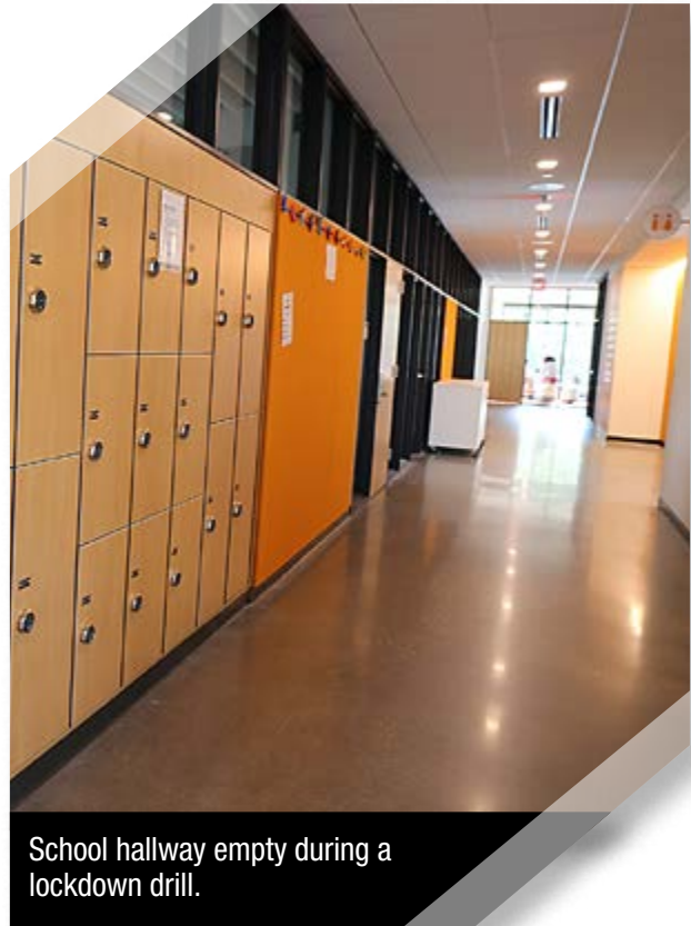
School hallway empty during a lockdown drill.

For example, despite the pandemic, schools are still required to conduct safety drills for fires, lockdowns, and severe weather such as tornadoes. The SFMD School Inspection Team continues advising schools regarding fire evacuation drills, reminding them that fire drills are