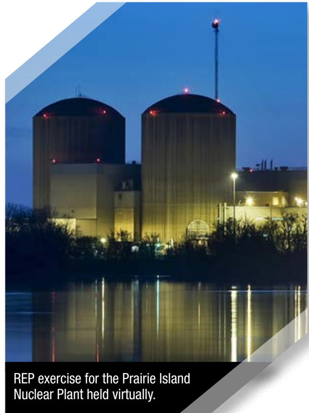
REP exercise for the Prairie Island Nuclear Plant held virtually.