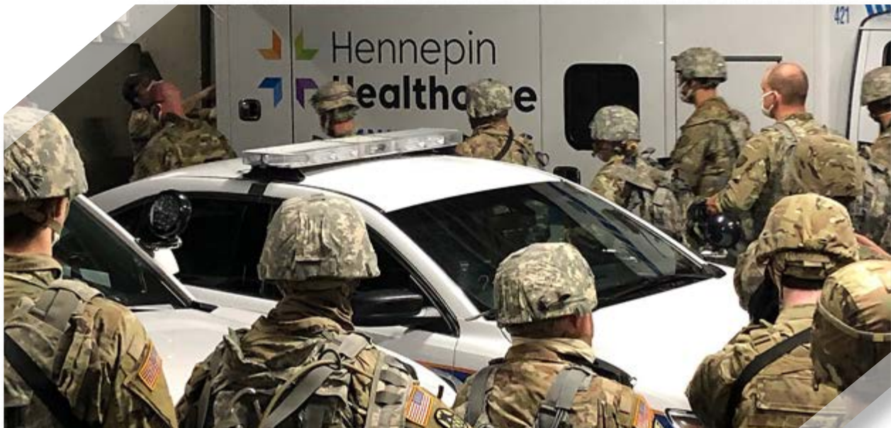
The SEOC provided logistics support to the MACC.